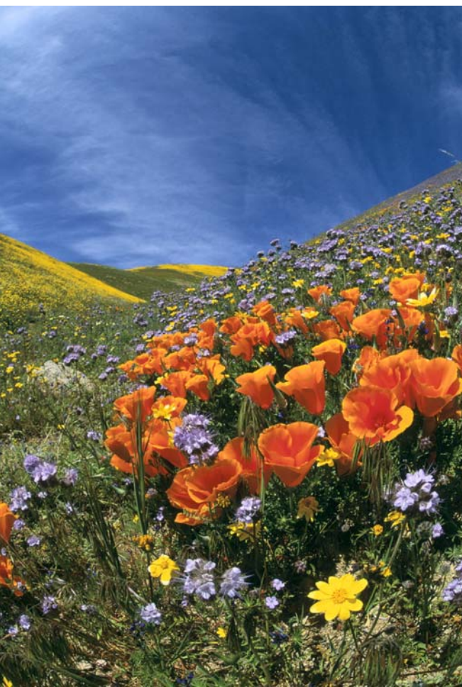
Mountains by Theodore Roosevelt