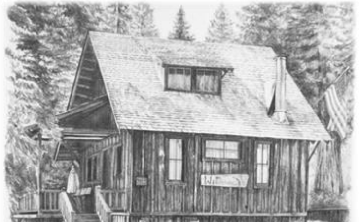
Preston Family Cabin, 1922 - Now owned by the Wilson Family Illustration courtesy artist Jana Botkin

The specific purpose of the WHDT is to preserve the historic district and community of Wilsonia in Kings Canyon National Park through a comprehensive program of historical research and education, structures maintenance and restoration, and public participation. In terms of structures maintenance and restoration, Architectural Guidelines, with the endorsement of SEKI, are now in place for cabin owners who are wishing to make changes to their cabins in ways that allow them to maintain historic cabin status when submitted to SHPO. The WHDT engages in educational programs, cataloging of Wilsonia cabin owner history, fundraising, and projects such as the recently completed sound system for the clubhouse. Work is still underway to provide a Wilsonia Directory to interested Wilsonia cabin owners.