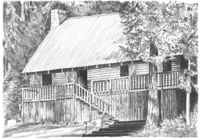
Wilsonia Clubhouse- 1933 Illustration courtesy artist Jana Botkin

In the first few years, individual lots in Wilsonia sold for $75 - $200. News of the sale of land in Wilsonia spread quickly by word of mouth. Most of Wilsonia property owners already had ties to the Grant Grove area from previous camping visits or knew other Wilsonia property owners. Valley residents accessed Wilsonia by various means including automobile, horse, and wagon. From the beginning, Wilsonia property owners had a concern for conservation of the forest landscape and planted giant sequoias on their property. Many lot owners camped on their land before they built their cabins. Most early cabins consisted of just one room or one room and a kitchen, with no electricity or running water. Ferguson drilled community wells throughout the lower section of the subdivision and everyone carried water from the wells. Eventually, most properties had their own well.